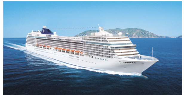
The MSC Poesia at sea